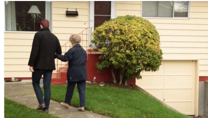
3-minute intro to NEST (Northeast Seattle Together)

We want to hear from you! Visit our web site, call, or send email if you have questions or ideas, or want to help our nonprofit organization grow.